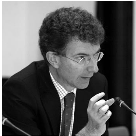
Christoph Heusgen presents the European Security Strategy.

The second part of the ESS stresses the strategic objectives the EU claims to real-