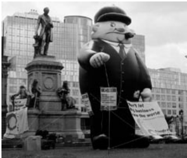
»Don't let big business rule the world«, Friends of the Earth protests in front of the European Parliament, Brussels, 2002.

ple—by increasing insulation and improving energy management instead of providing energy. In general, we need to focus on strategies that lower resource use—especially in the North—and improve quality of life. Policies to implement such sufficiency strategies and reduce resource use in other ways should always take precedence over trade.