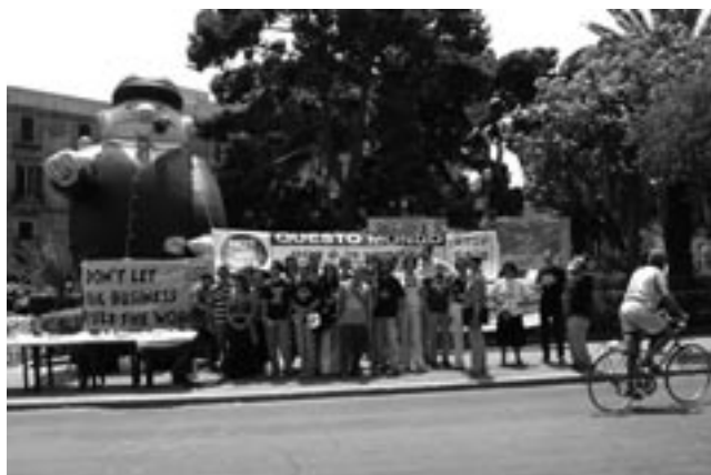
Seattle to Brussels Network Protest at EU Trade Ministerial, July 2003