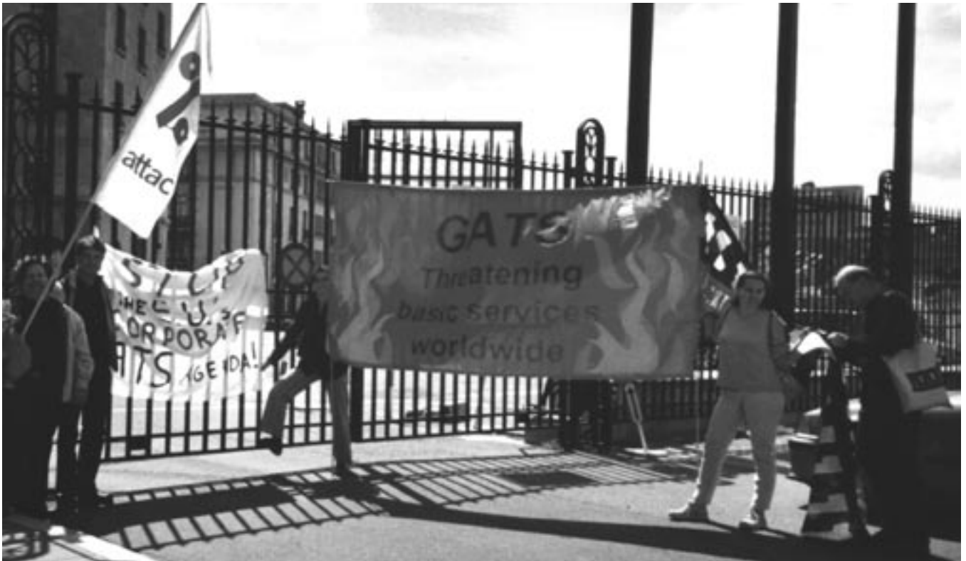
Demonstration at European Services Forum meeting, Brussels, March 2003.

The Cancún collapse forced business to rethink their