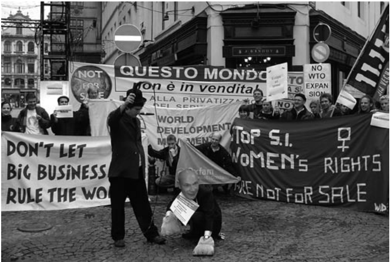
EU Trade Commissioner Pascal Lamy successfully lobbied to promote corporate profits, to oppose development, environment and democracy