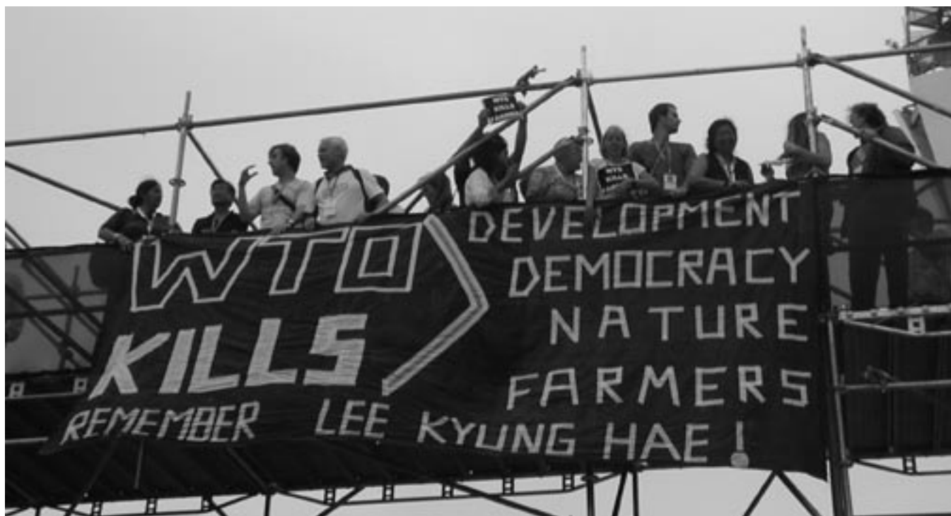
Banner drop in Cancún. The bridge is right next to the Convention Centre.

perspective. In February 2004, the Ambassador of Chile was re-appointed as chairman of the Council of Trade in Services. Meetings on GATS issues took place in the WTO during the whole first half-year.