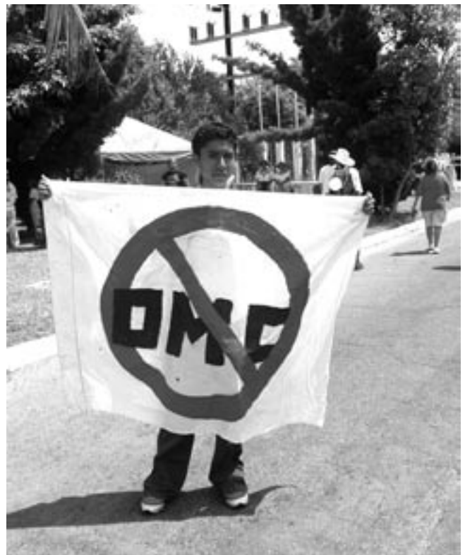
Anti-WTO Protest in Cancún, Mexico

Up to now critical civil society actors in Europe have largely neglected the interplay of the various levels of EU trade policies and attained very little knowledge of