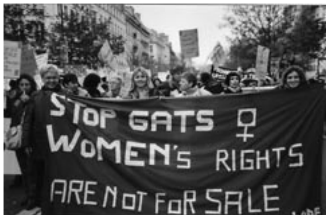
Anti-GATS demonstration, Brussels, February 2003.