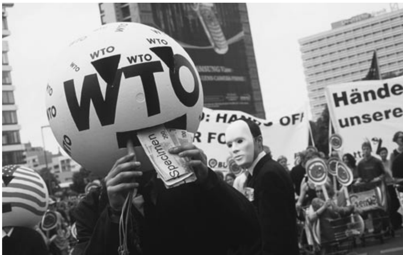
The environment in the trap of globalisation: a joint Greenpeace/Friends of the Earth/Attac demonstration, McPlanet Congress, Berlin 2003