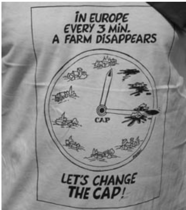
Let's change the CAP, says the European Farmer's Association

After believing that more trade will bring more development, as WTO claims, many third countries realised after 1994 that they did not profit at all from so called »liberalisation« of agricultural trade. The impressive demonstrations in Seattle in 1999 allowed them to say no to the next step proposed by WTO. The above described trick has become clear for many governments: the question is just if they have the political force to say no to the huge economic/military pressure of US & EU.