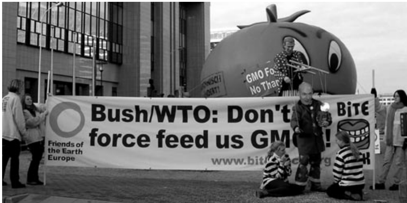
EU Trade Commissioner Pascal Lamy caves in under pressure from Bush/WTO

The US has initiated the current trade dispute over genetically modified food and farming to help big agri business. US maize farmers claim they are losing 300 million dollars a year because they cannot sell their