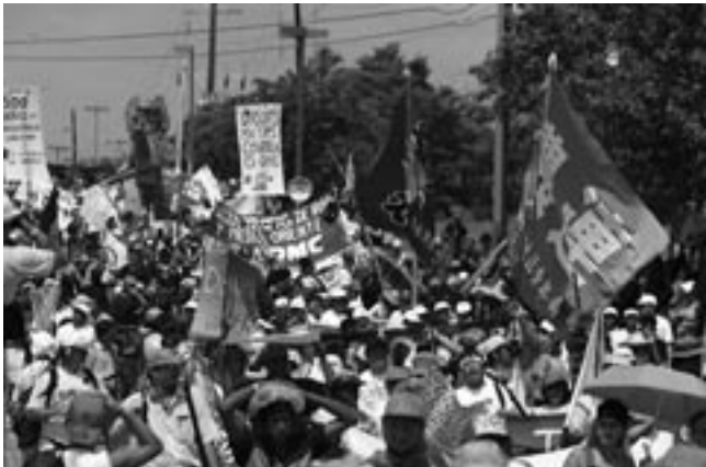
Activists participate in the big mobilization against war and globalization, Cancún

development means the provision of jobs in the manufacturing and industrial sectors. This will also allow for effective diversification and development of the rural and agricultural sectors. This will also raise the country's overall level of productivity. There will be important backward and forward linkages in the country's economy as its industrial and manufacturing sectors develop. It will raise the level of hard and soft technologies.