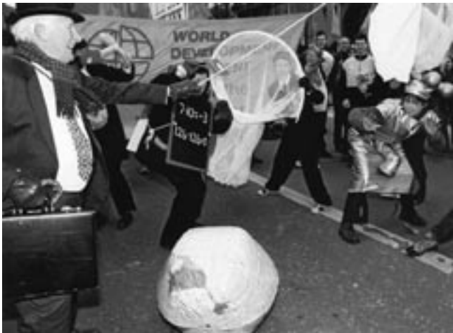
Catch the globe: Acting protest at a GATS demonstration in Brussels

mission bureaucrats, such documents ›cannot and will not‹ be made publicly available.