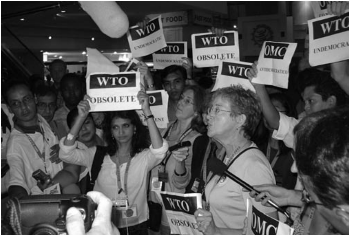
WTO is obsolete, say activists of the ›Our World is Not For Sale network‹ in Cancún

these negotiations aim at speeding up the passage of goods across the borders, by reviewing, modernising and standardising the customs procedures among the WTO members. Trade Facilitation has often been seen as the least dangerous among the four Singapore Issues, but nevertheless it poses some serious questions and threats for developing countries. New customs rules could mean high costs of implementation for infrastructures, training, etc, which are hardly affordable for the poorer nations. Some developed countries (notably the US) have already proposed to aid developing nations with the implementation and help covering the costs, which means to further condition these countries' trade to developed countries' technologies and control. On the other hand, refusing this aid could lead to »irregular« customs procedures, and thus risk being