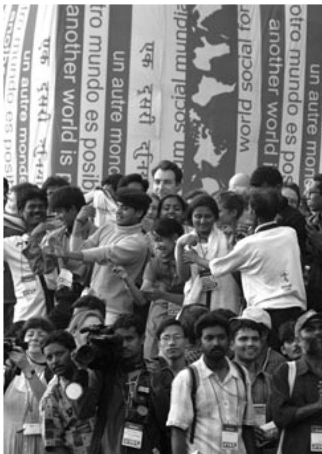
Another world is possible, World Social Forum Mumbai 2004

are looking for serious breakthroughs in these areas in Cancún». The corporations haven't changed their tune. We should take their priorities seriously in setting our own. We are for what they are against and vice-versa.